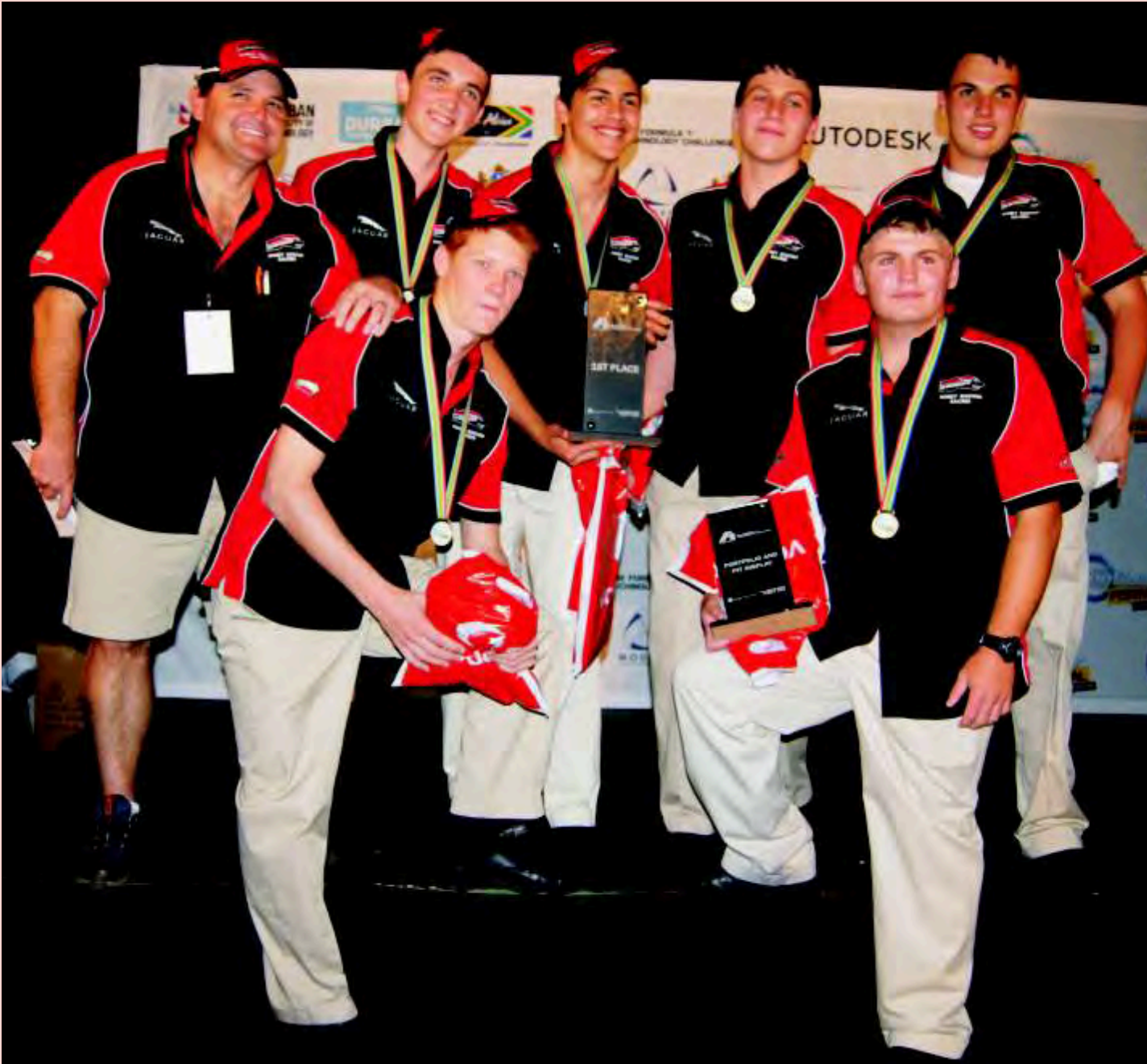
Team Honey Badger are the champions of the The F1 in Schools Technology Challenge 2014.

CLIFTON COLLEGE PUPILS WERE ALL SMILES AS THEIR TEAM COMPETING IN THIS YEAR'S TOP GEAR FESTIVAL'S LEGACY PROJECT - THE F1 IN SCHOOLS CHALLENGE 2014, WERE CROWNED CHAMPIONS, AT THE FINALS. THE EVENT WAS HELD AT SUNCOAST CASINO AND ENTERTAINMENT WORLD ON SATURDAY (17 MAY 2014).