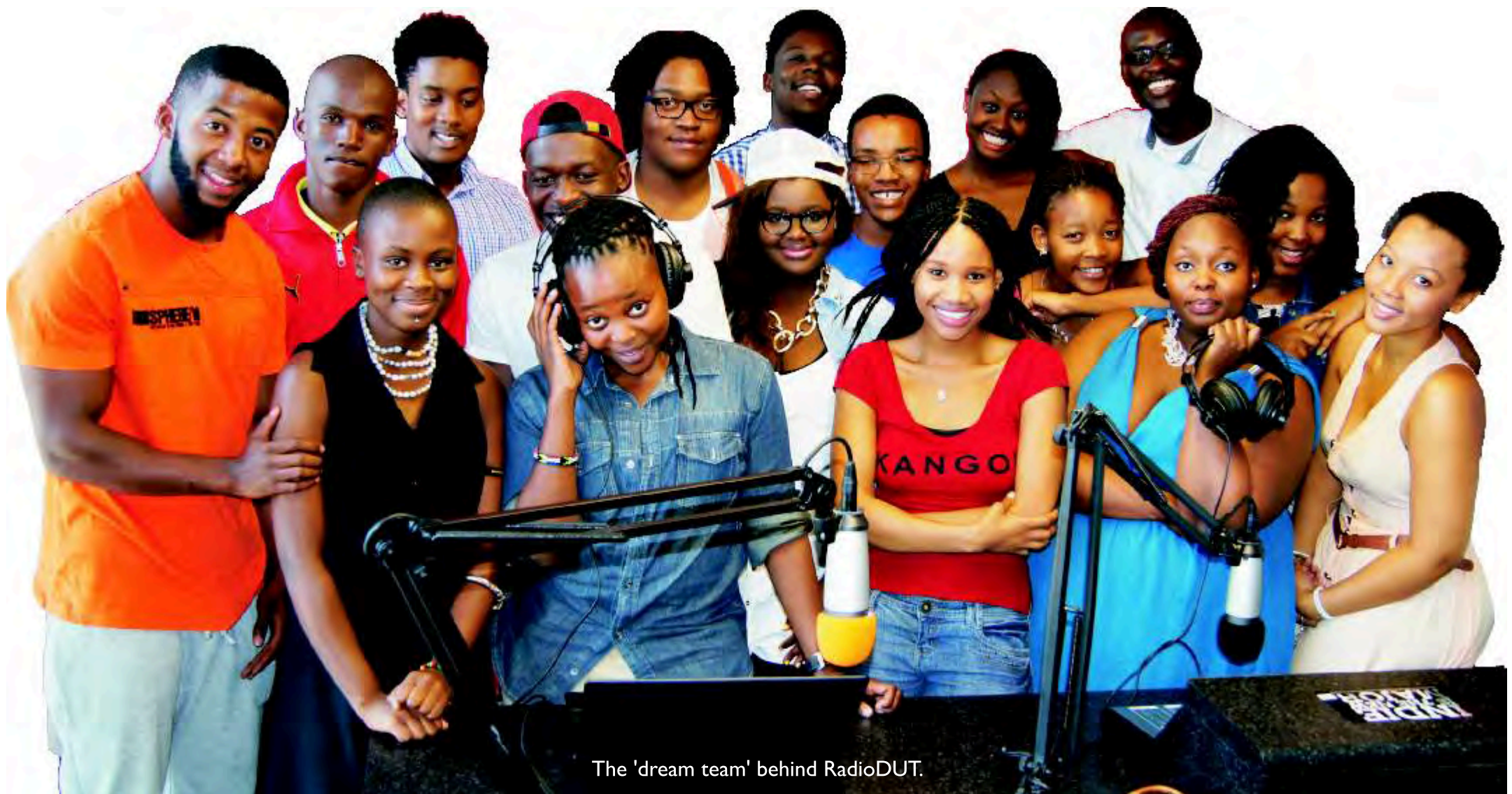
The 'dream team' behind RadioDUT.

So go on, experience the true sound of radioDUT, the soundtrack to your life!