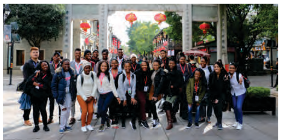
Pictured: Students at the Fourth Session of the Chinese Bridge Winter Camp in China, successfully held in FAFU.

From 23 December 2017 to 11 January, 2018, the Fourth Session of the Chinese Bridge Winter Camp in China of the DUT CI was successfully held in FAFU. There were 22 young students from South Africa (18 from DUT and four from PAX College) were invited to join this programme. During the visit in Fujian, the campers underwent a 16-day camp, learning the profound Chinese culture, experiencing the rapid development of China, enjoying the wonderful scenery of the mountains and