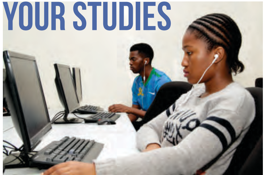
Pictured: DUT students make use of e-learning for their studies.

Every year many students join DUT who have not yet had the opportunity to work with computers. Your lecturers are aware of this and you should be given