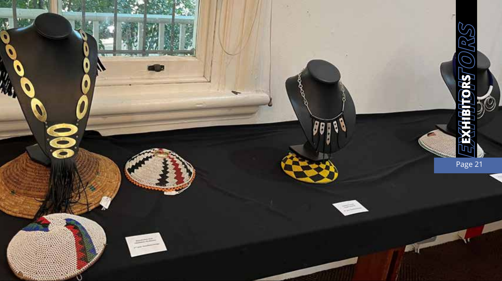
Jewellery Design students work currently on exhibition at the Phansi Museum