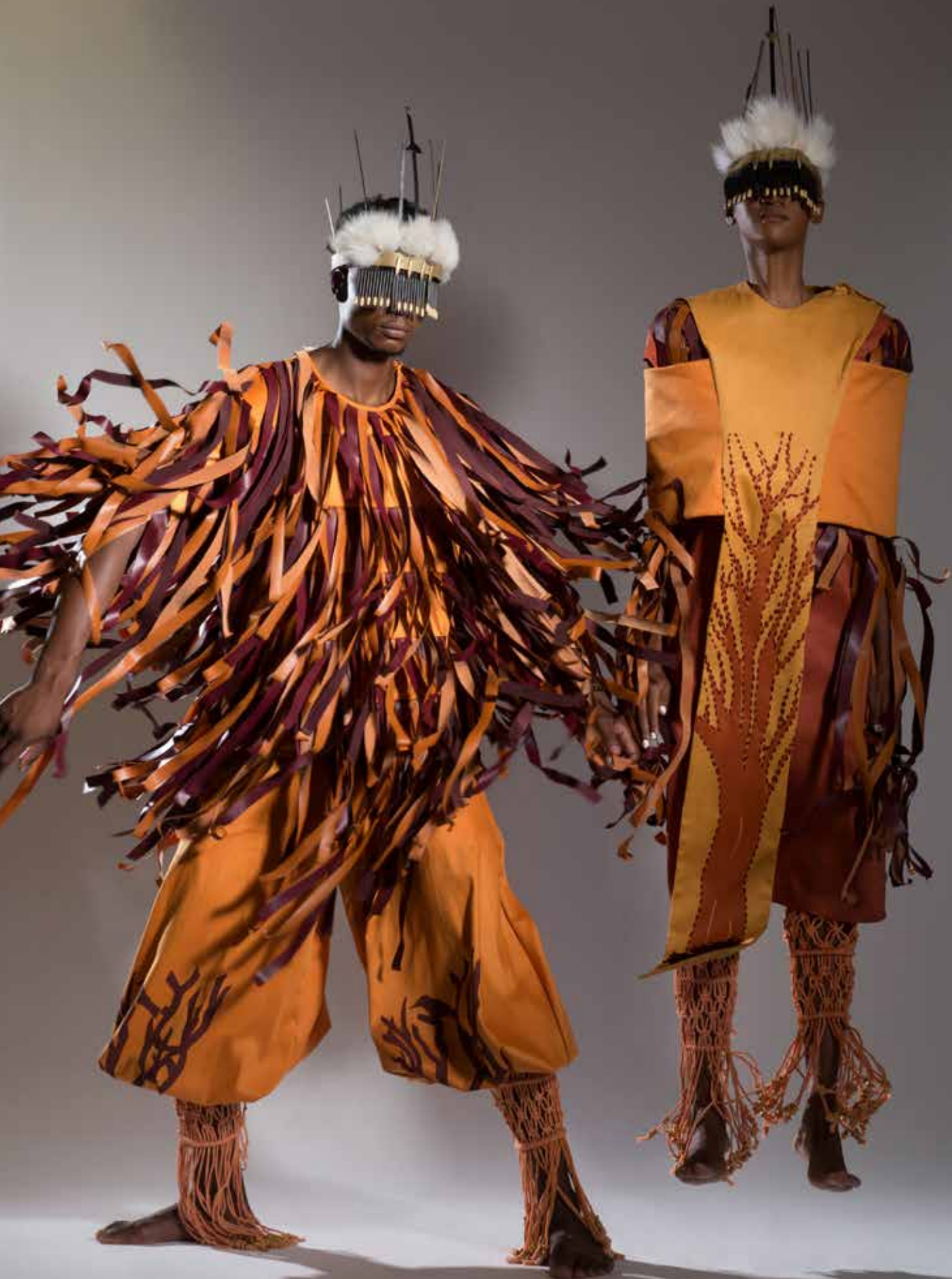
Fashions students made garments interpreting the history 'Ubuntu-art' artefacts housed at the Phansi Museum.