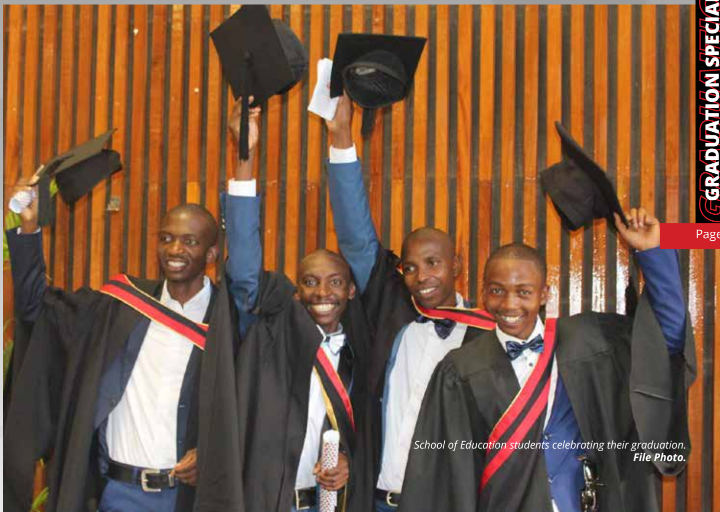
School of Education students celebrating their graduation. File Photo.