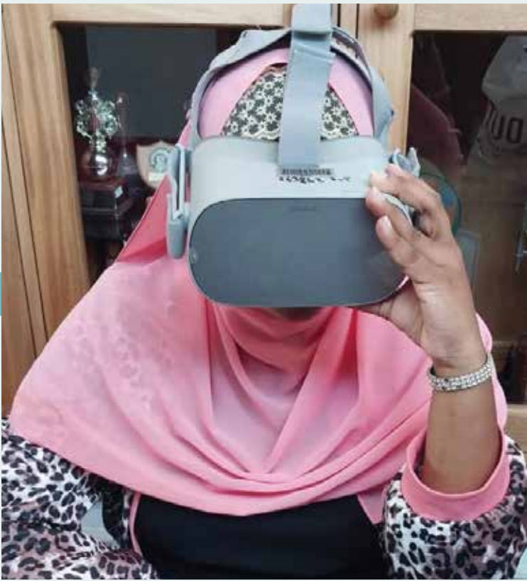
Pictured: Educators at the RoboGirl training.