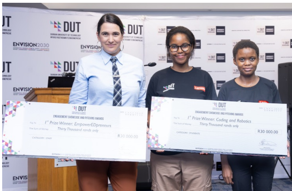
Pictured: The first prize staff and student winners at the awards event.

"We celebrate those who have dared to innovate, those who have dared to lead and those who have dared to make a difference. To our finalists, I say this, you are the architects of tomorrow, the visionaries of the future. Your ideas have the power to shape the world around us and to inspire generations to come. As you stand on the cusp of greatness, remember that success is not merely about achieving your goal; it's about the journey, the resilience and the unwavering