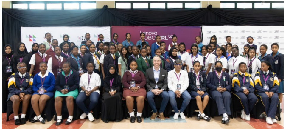
Pictured: The group of girls who are part of the RoboGirl Programme.