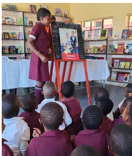
Pictured: Learners from Bambanani during the Readathon.

creating platforms for young learners to showcase their talents, the initiative aims to inspire a lifelong passion for literature. Through events like the Readathon and the Bookathon, the University continues to contribute to the development of future generations, one page at a time.