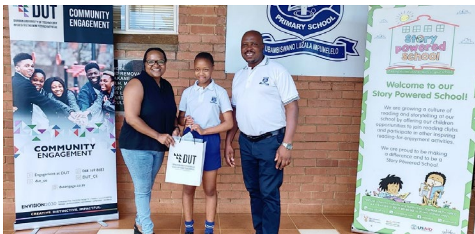
Pictured: A Learner and a Principal from Sbavana Primary School receiving the awards won during the Bookathon 2023.

The event reflected DUT's commitment to community engagement and educational empowerment. By fostering a love for reading and