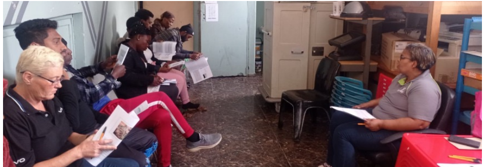
Pictured: Residents of Payless Shelter during the workshop hosted by DUT's Department of Human Resources Management.

The Department of Human Resources Management in the Faculty of Management Sciences at the Durban University of Technology (DUT) recently embarked on a community engagement programme where they provided skills development workshops to residents of Payless Shelter, a homeless shelter in South Beach, Durban.