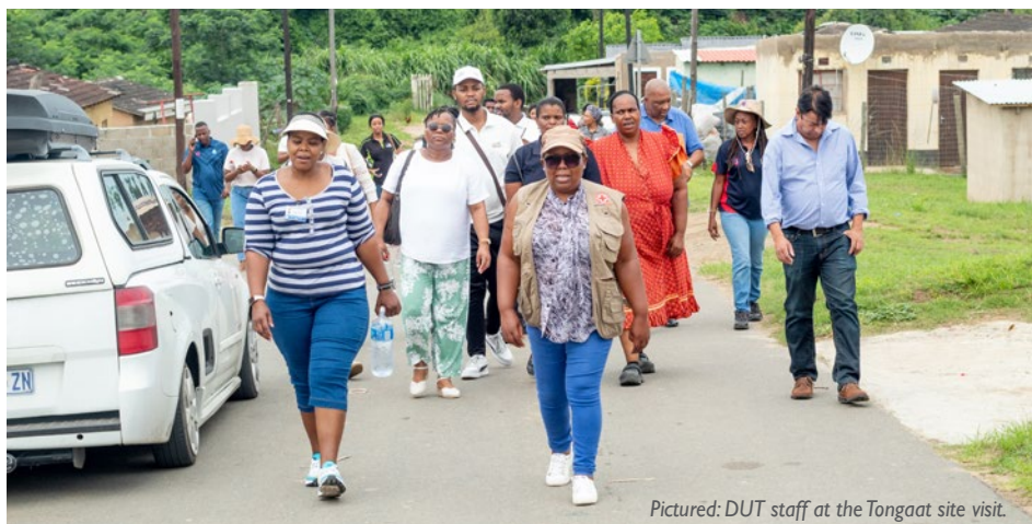
Pictured: DUT staff at the Tongaat site visit.

“Universities are vital in connecting climate research with real-world action. By working with communities, NGOs and governments, they help turn policies and academic theory into practical, community-led solutions. This kind of participatory research empowers people to take ownership of climate adaptation, making responses more effective and sustainable,” he said.