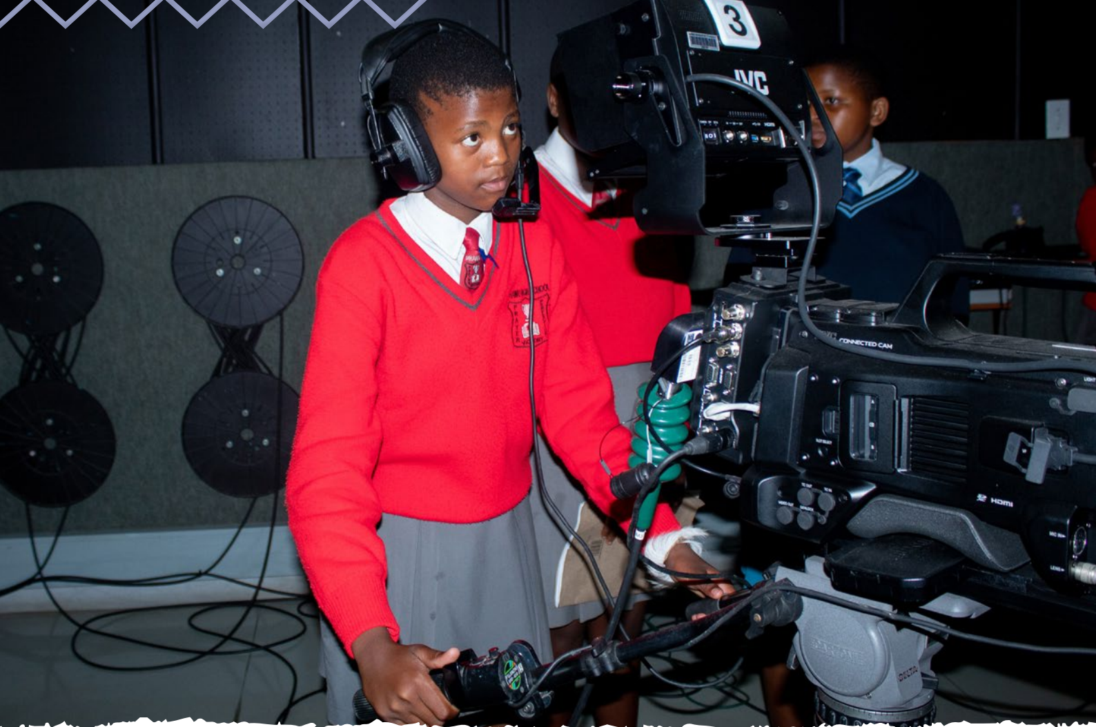
Pictured: Learners from Mhawu and Nwabi High School during the Video Technology Campus Visit.

Engagement at DUT is the portfolio under the office of the Deputy Vice-Chancellor Research Innovation and Engagement (DVC-RIE), Durban University of Technology (DUT). The Engagement Office champions initiatives, efforts and activities that focus on establishing the University as a responsible, relevant and active partner of the community in addressing the needs of society. Through engagement, the University facilitates collaboration among DUT staff, students, alumni and the community for meaningful university-community engagements. This newsletter seeks to capture and showcase community engagement projects that have been initiated by staff and students as part of service learning, community-based research, scholarly service and community outreach or volunteering efforts. Showcasing these projects recognises staff, students and social partners for their exceptional commitment to community engagement in line with the DUT strategy, ENVISION2030.