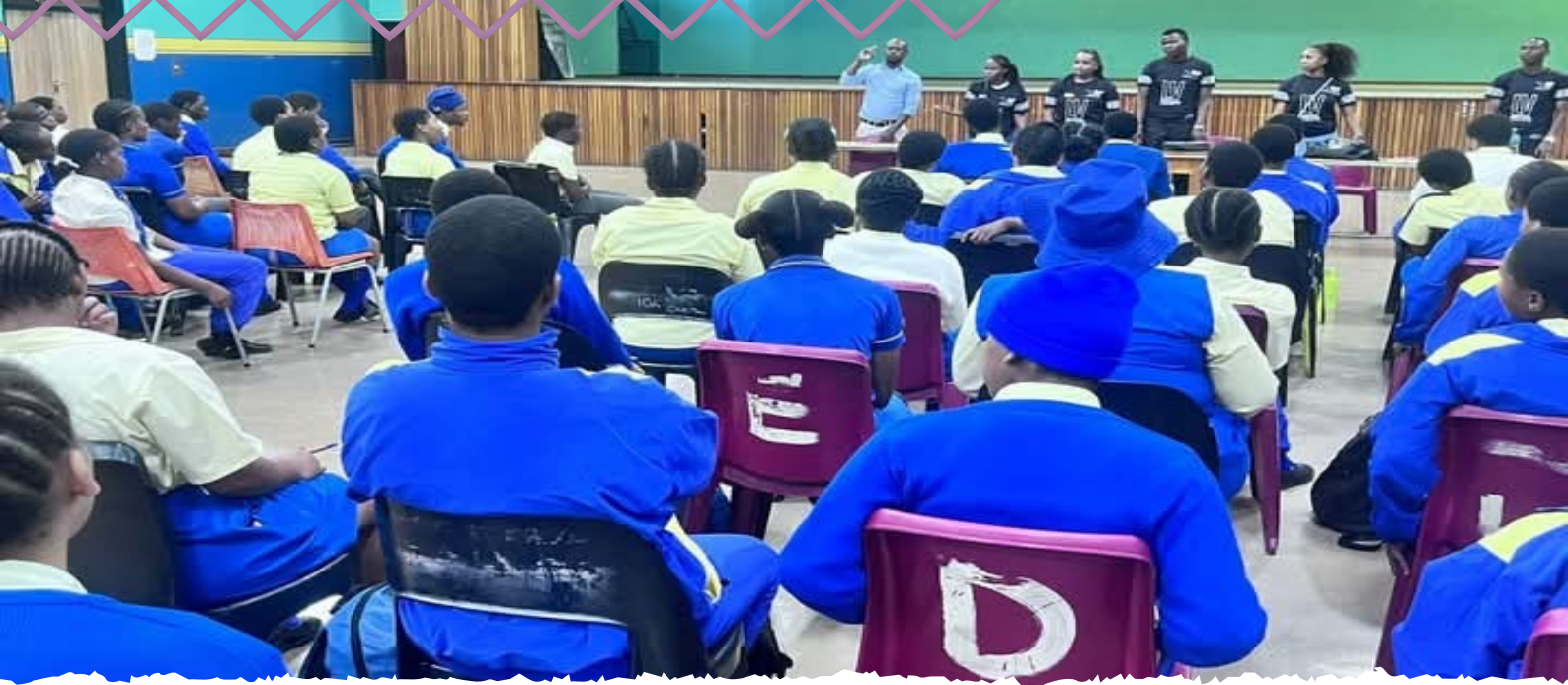
Pictured: Siyakhula Msinga Empowerment.