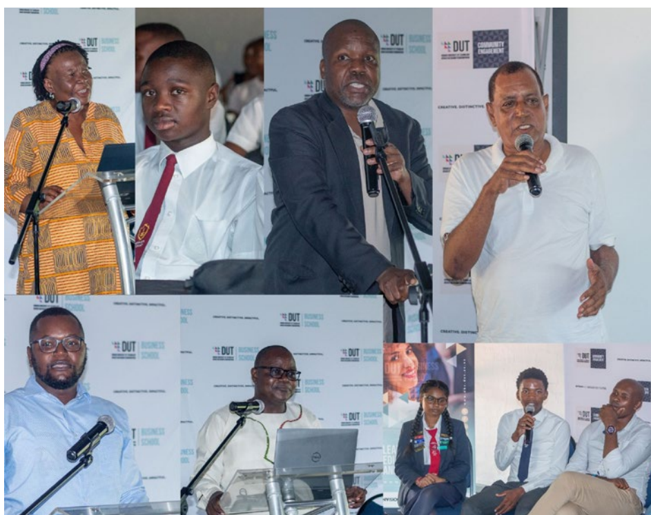
Pictured: Panel speakers and attendees of the Climate Change Pre-Conference.

The Climate Change Pre-Conference set the stage for the main conference, which took place on the 26–27 February 2025 at the Coastlands Hotel. The event underscored the urgency of addressing