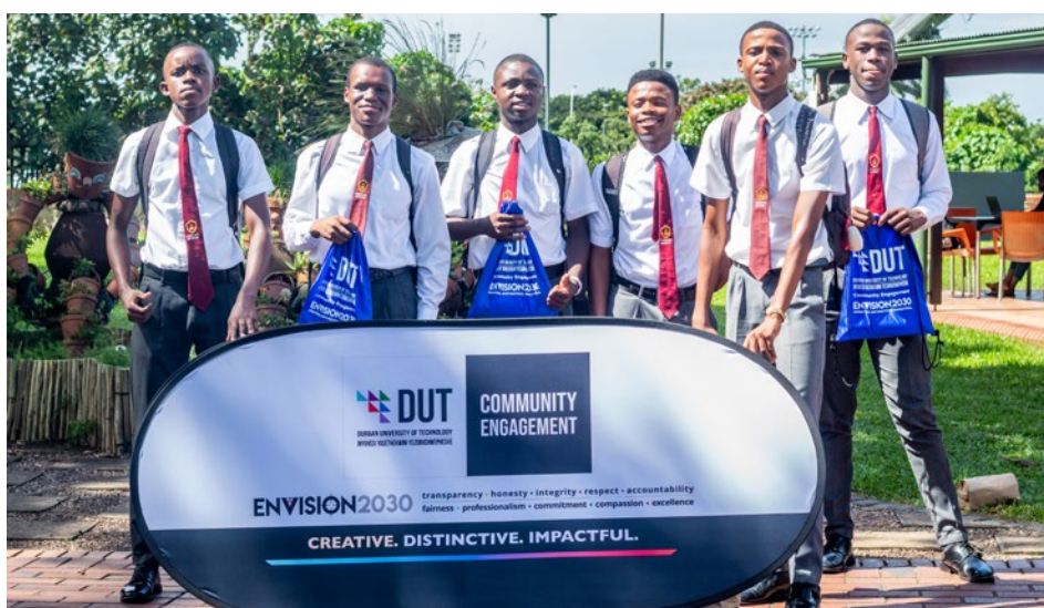
Pictured: Learners from Chatsworth Secondary who attended the Climate Change Pre-Conference.