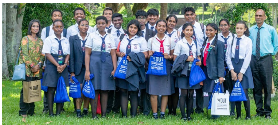
Pictured: Learners and educators from Seatides Combined School who attended the Climate change Pre-Conference.

"Leadership means taking action. And if we all take action, then we can be able to save the planet. Because this planet is that environment