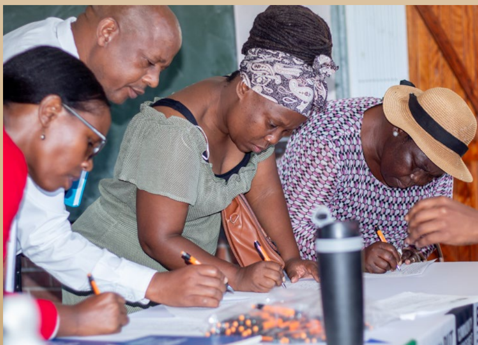
Pictured: Mahlabathini CMC Principals attending the Risk Management Workshop.