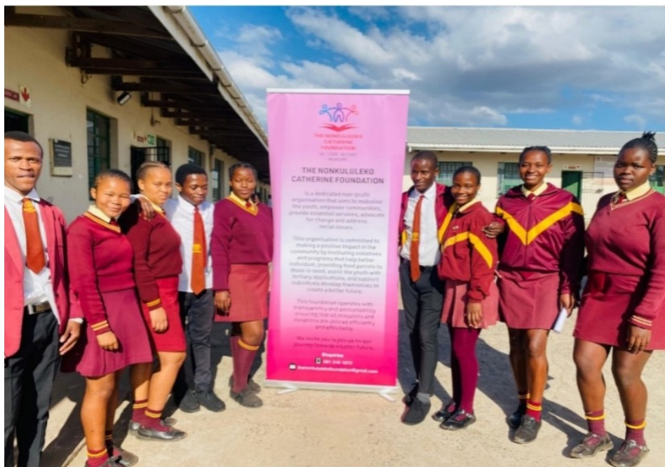
Pictured: Members of the Nonkululeko Catherine Foundation during their Road to Varsity initiative at Ezithabeni Secondary School.