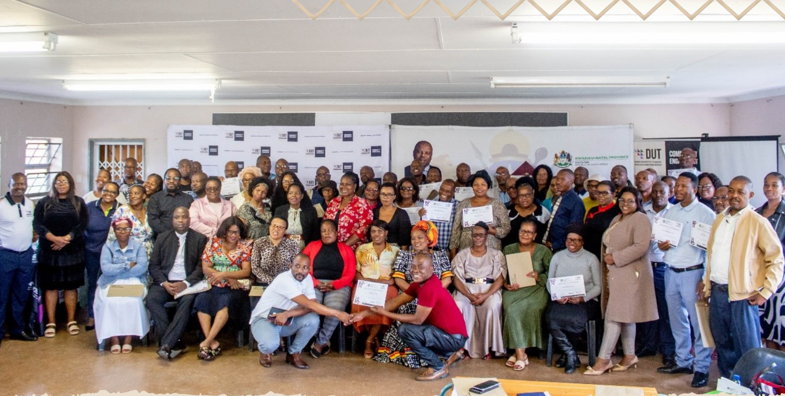
Pictured: DUT Team with the KZN DOE Team, Mahlabathini CMC and School Principals from the Mahlabathini CMC who attended the Workshop.