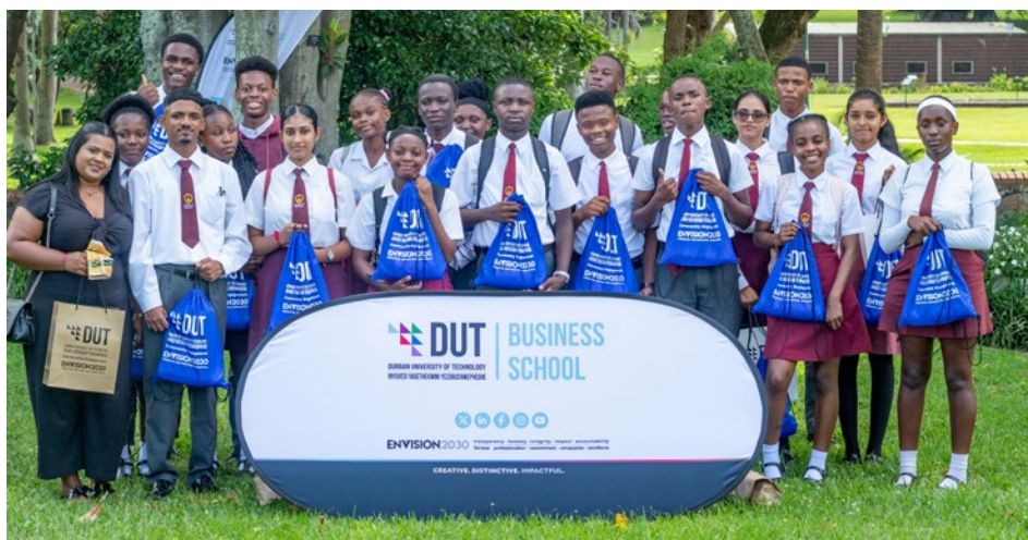
Pictured: Learners and educator from Chatsworth Secondary School who attended the Climate change Pre-Conference.