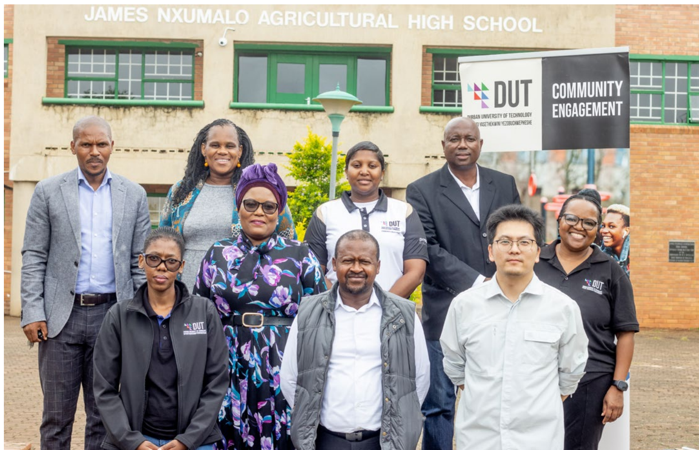
Pictured: DUT team with the Mahlabathini CMC team at the James Nxumalo Agricultural High School.