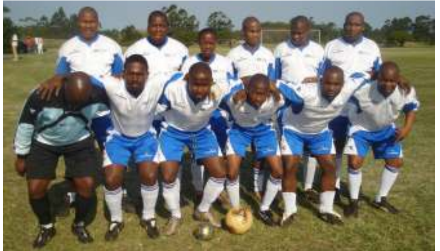
DUT's Power House Football Club on the sports field

The DUT's Power House Football Club meets on Fridays, depending on the availability of the soccer field, as a social networking platform for staff, students and alumni who have a common interest in the sport. Practice sessions for the strategic game focuses on mental and physical fitness training. The club welcomes new staff and student membership and is keen on increasing the number of games played against other institutions and corporates.