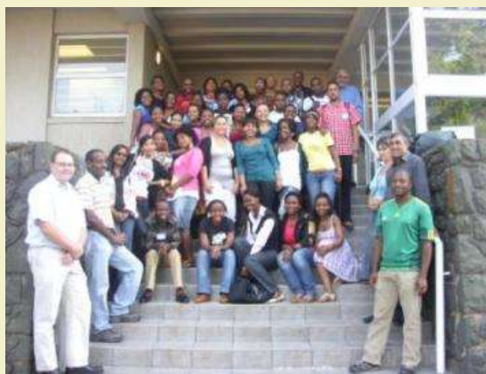
Pictured: Student and staff from DUT's Environmental Health Programme together with facilitators from the Medical Research Council's Malaria Research Programme