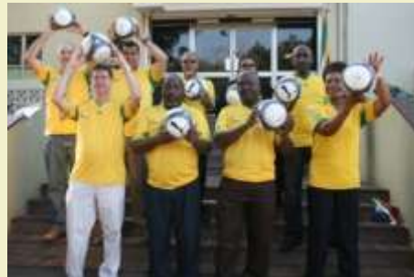
Bafana Bafana T-Shirts are sponsored with courtesy of the South African Breweries Limited